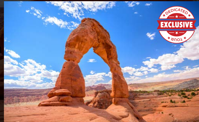
DELICATE ARCH (Dedicated Tour)