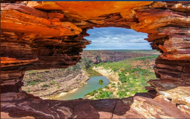
WINDOWS LOOP TRAIL