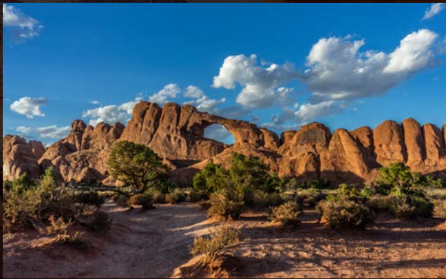
DEVIL'S GARDEN TRAIL