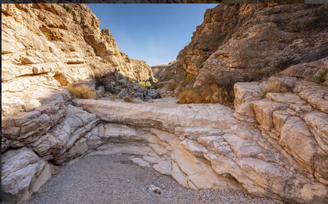
ERNST TINAJA TRAIL