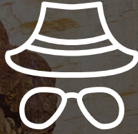
Hat & Glasses