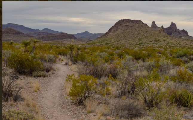
MULE EAR SPRING