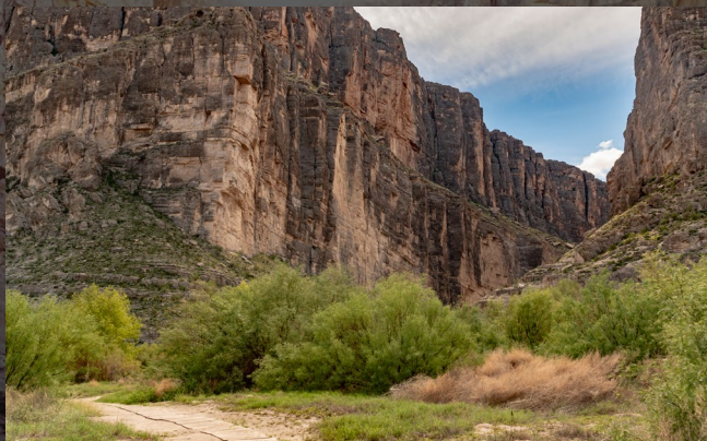
SANTA ELENA CANYON TRAIL