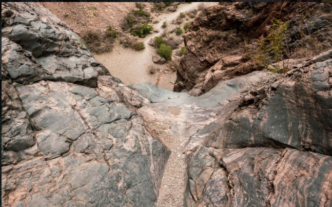
UPPER BURRO MESA POUR-OFF TRAIL