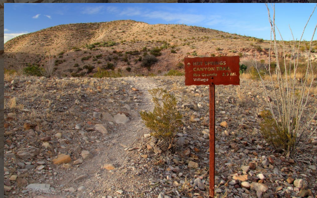
BIG BEND HOT SPRINGS TRAIL