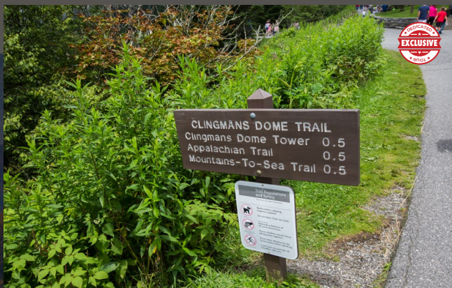
CLINGMANS DOME (Dedicated Tour)