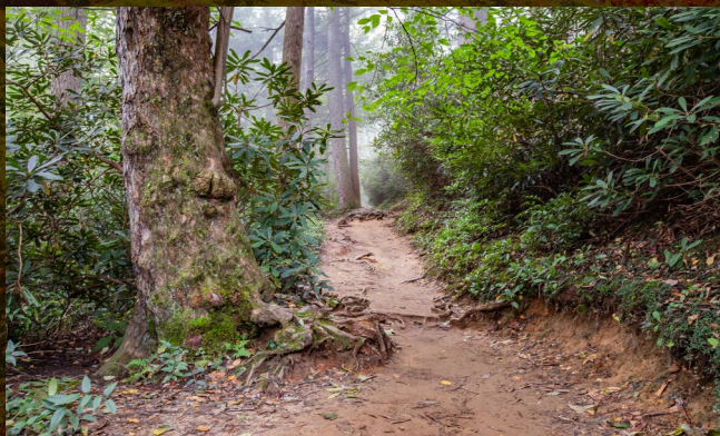
TRILLIUM GAP TRAIL