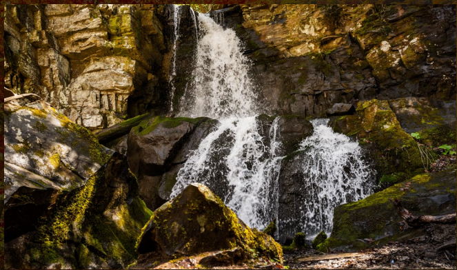
BASKINS CREEK TRAIL