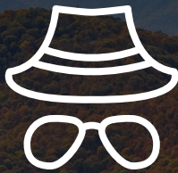
Hat & Glasses