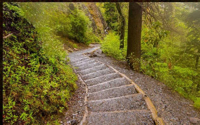
ALUM CAVE TRAIL