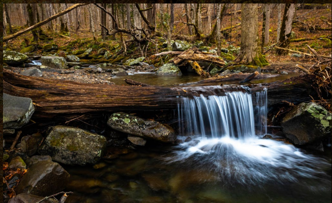
RAINBOW FALLS TRAIL