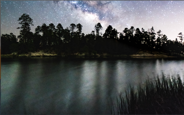
ROSE CANYON LAKE TRAIL