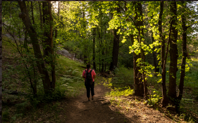
BUG SPRING TRAIL