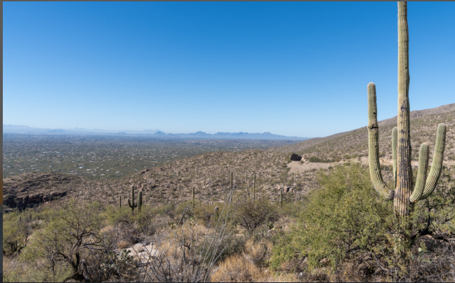
BABAD DO'AG TRAIL