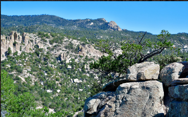
MOLINO BASIN TRAIL