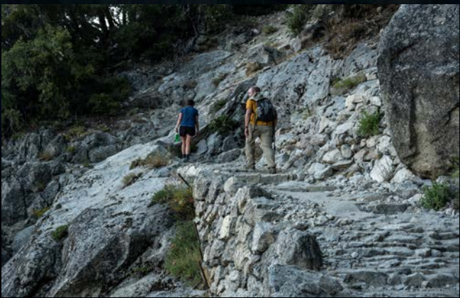
FOUR MILE TRAIL