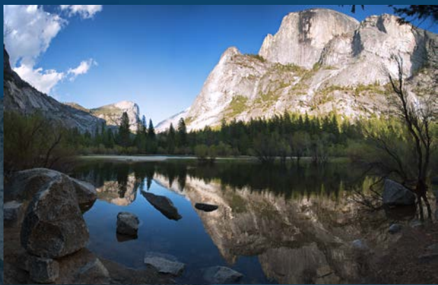
MIRROR LAKE PAVED TRAIL