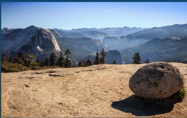
SENTINEL DOME TRAIL