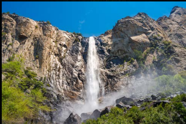
UPPER YOSEMITE FALLS TRAIL